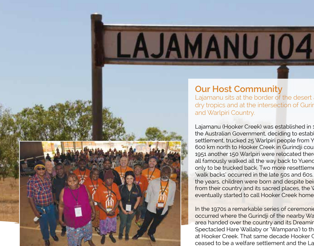
PAW Media Board and Staff.